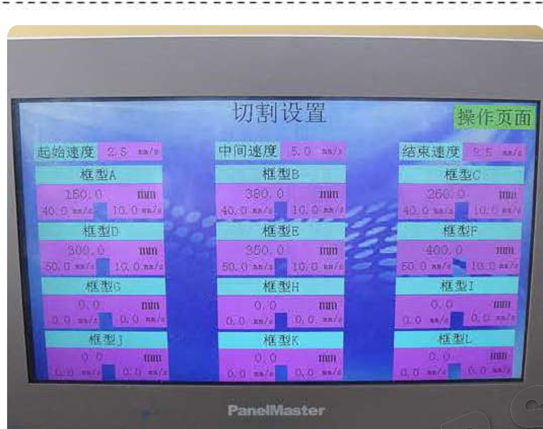
● Control panel