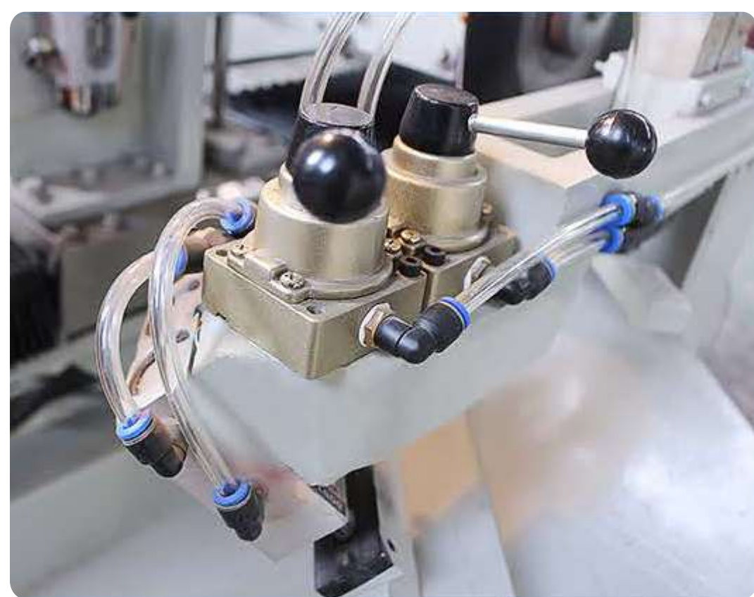
● Pneumatic clamp