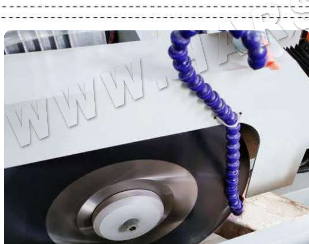
● 45° Cutting (Left)