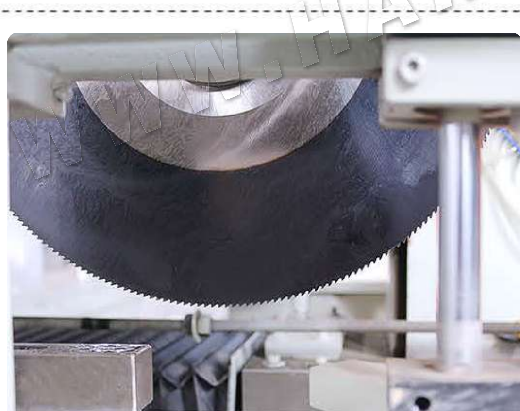
● HSS high quality cutting blade