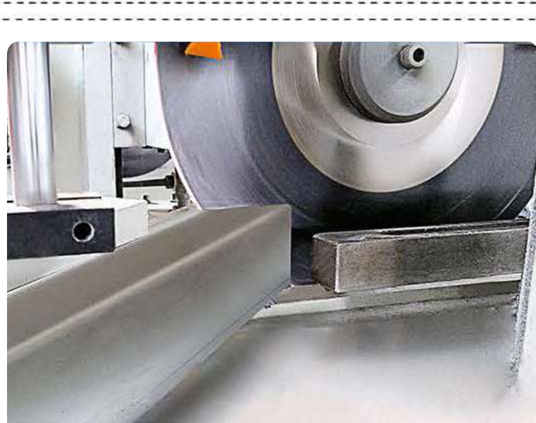
● 45° Cutting (Right)